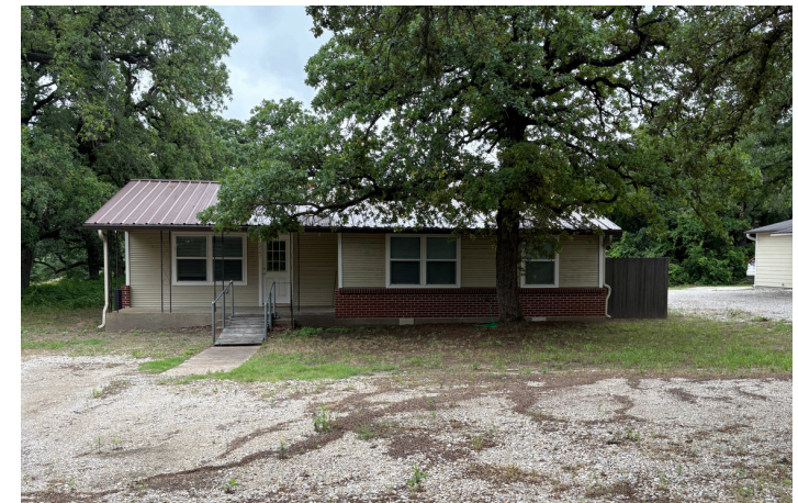
4 income-producing homes currently on site