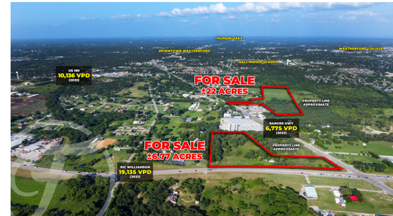
Ideal for RV Park, Build-to-Rent, or Industrial Development